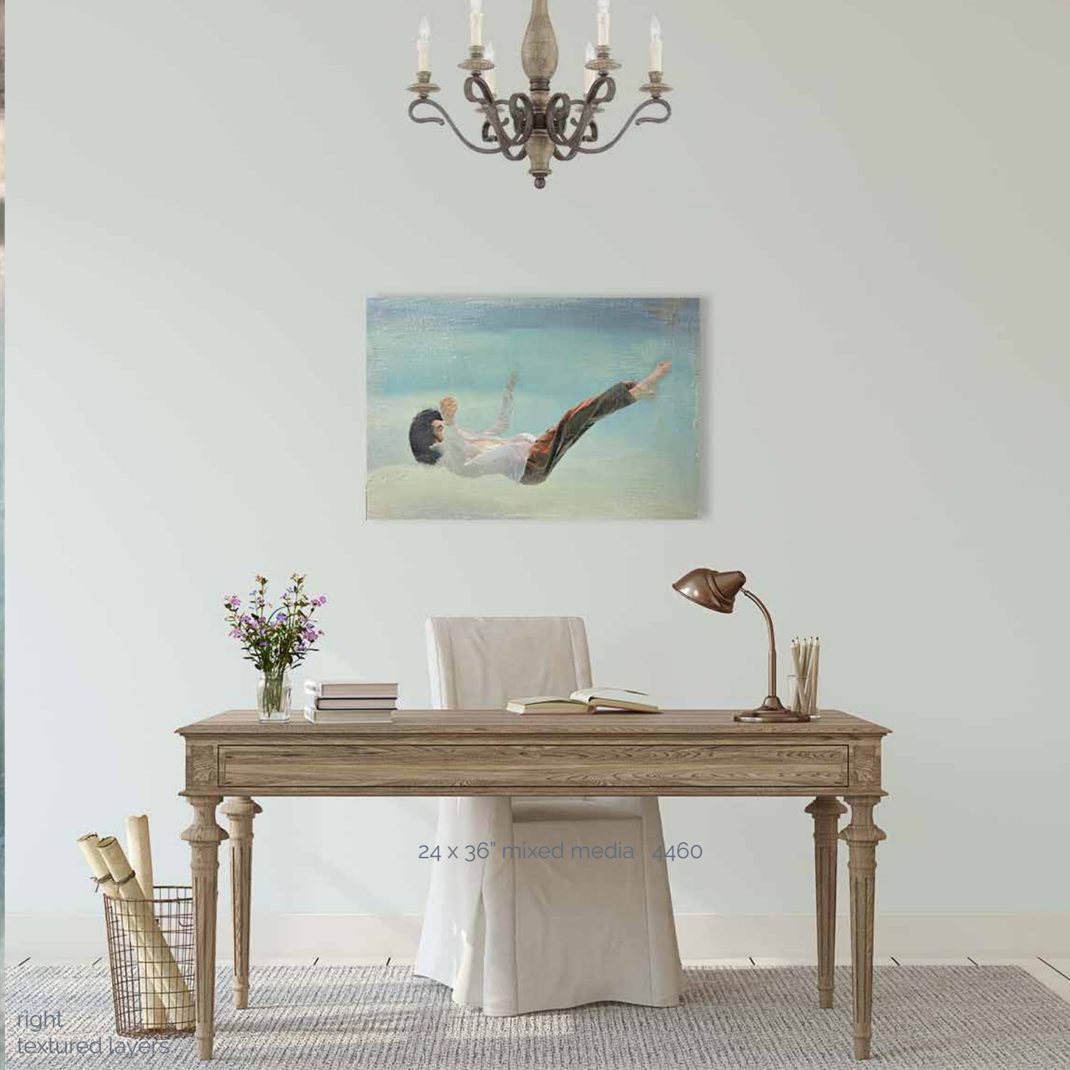
right textured layers