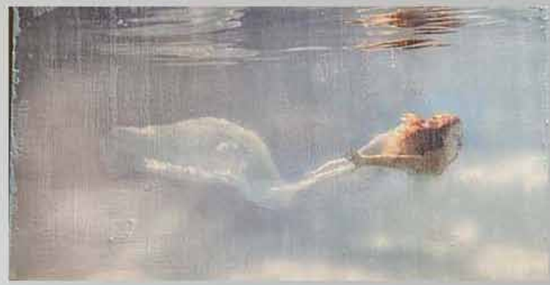
24 x 48" mixed media 5300