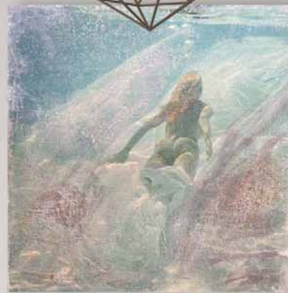
36 x 36" mixed media 5300