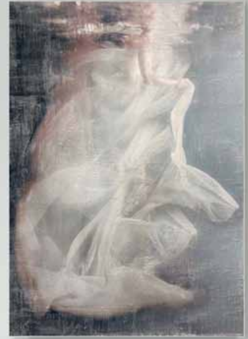
36 x 48" mixed media 5890